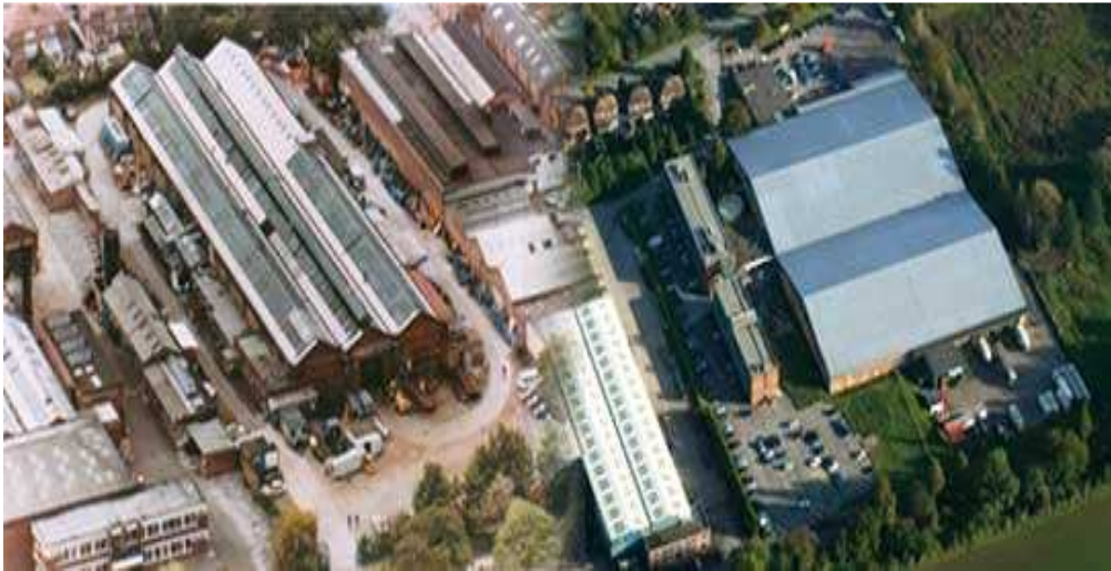
Forest City Factory in Stretford

The company now concentrates on the production and supply of diesel generators and mobile tower lights, and the supply of all related original manufacturers spare parts.